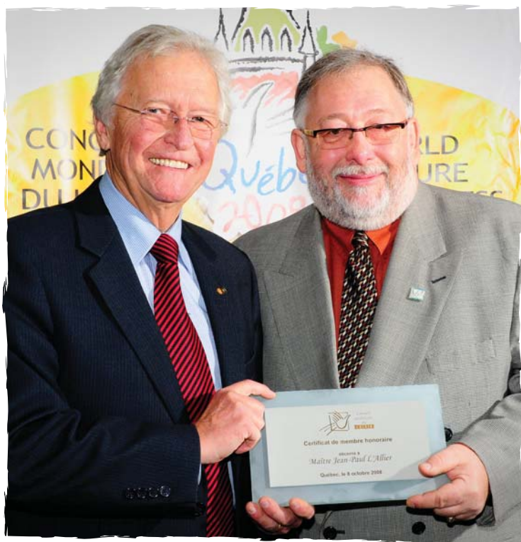
Certificat de membre honoraire présenté à Maitre Jean-Paul L'Allier Québec, le 8 octobre 2008

By receiving this honour, Mr. L'Allier joins four other Québec personalities who have made history in the field of leisure, Messrs. Joffre Dumazedier, Claude Ryan and Claude Charron.